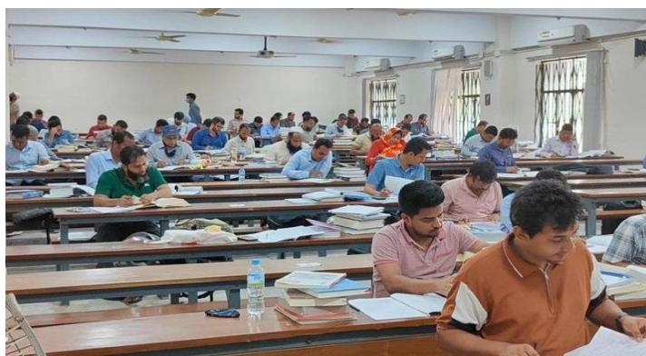
SEng (Structural Engineering) Exam is going on at BUET on November 17, 2022

The PRP-Portal provides a one-stop platform for administering the SEng training program and the SEng exam application process. A total of 2,942 individuals registered on the portal. Of which, 1,100 individuals have attended each session. A total of 900 registrants attended at least 30 out of 48 SEng sessions and 5 out of 8 seismic sessions which were the qualifying criteria for SEng exam. The exam for SEng was taken in November 10 and 17 of 2022.