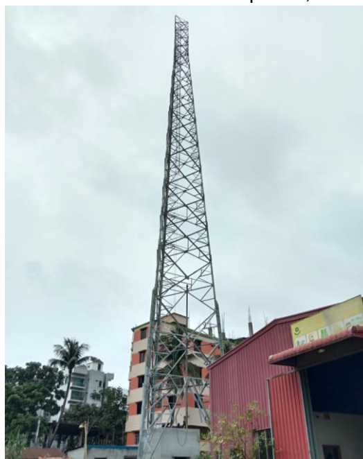
Green Field tower