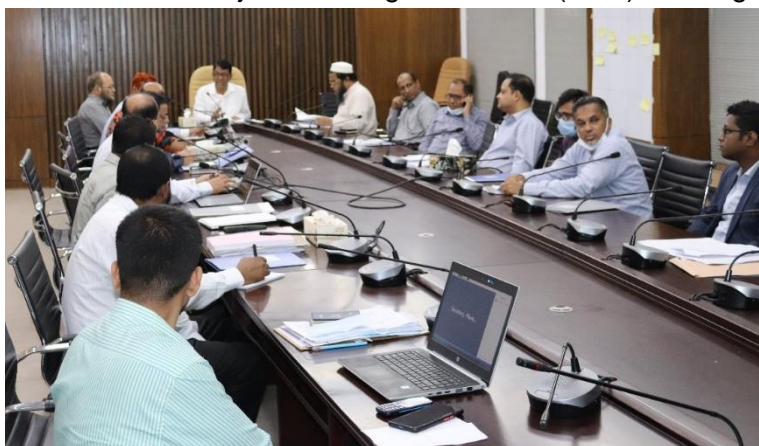
19 th Project Steering Committee Meeting